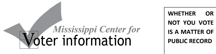
Figure A1: Treatment Mailing Design Template. The key variation distinguishing the positive social pressure treatment mailer and the negative social pressure treatment mailer occurs below the box displaying the subject's past voting record. The positive social pressure treatment states "We noticed you voted" whereas the negative social pressure treatment states "We noticed you didn't vote."